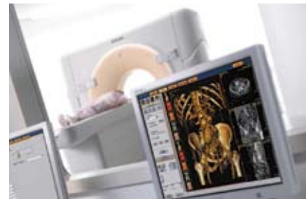
PRMC's digital CT scanner provides enhanced images in less time.

From the patient's perspective, digital mammography feels identical to conventional screenings.